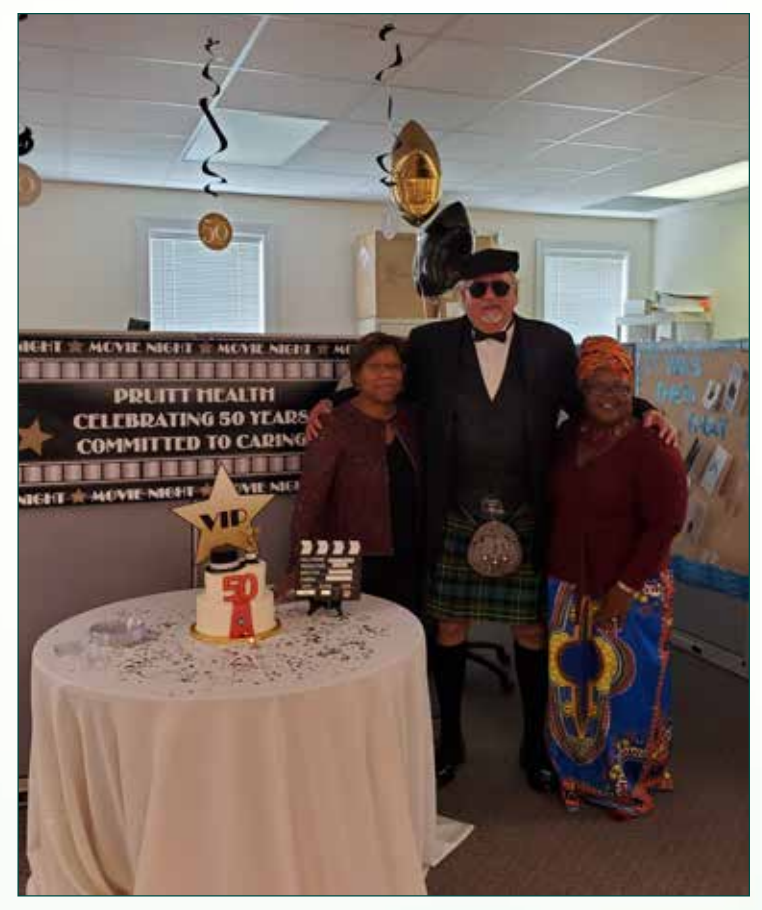
PruittHealth Hospice (Fayetteville)