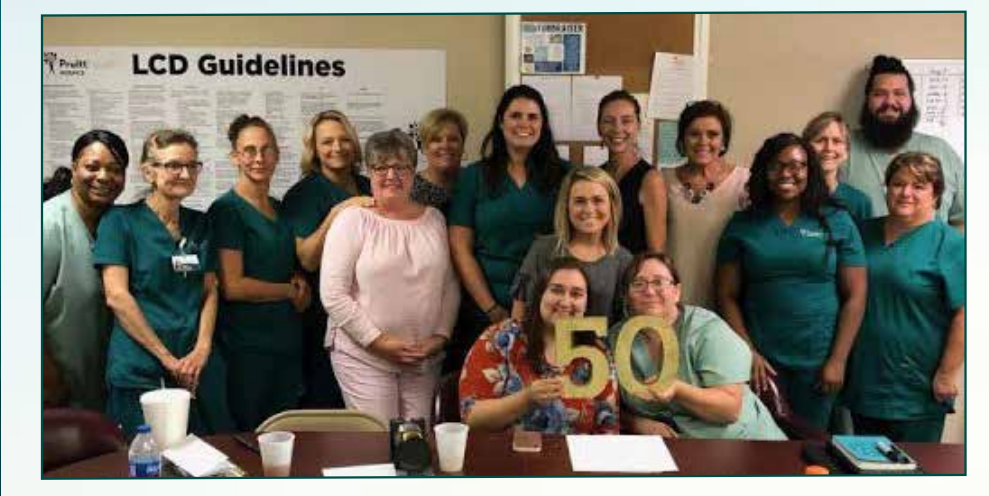
PruittHealth Hospice (Anderson)