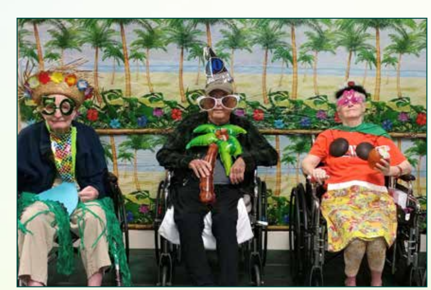
The Oaks - Athens