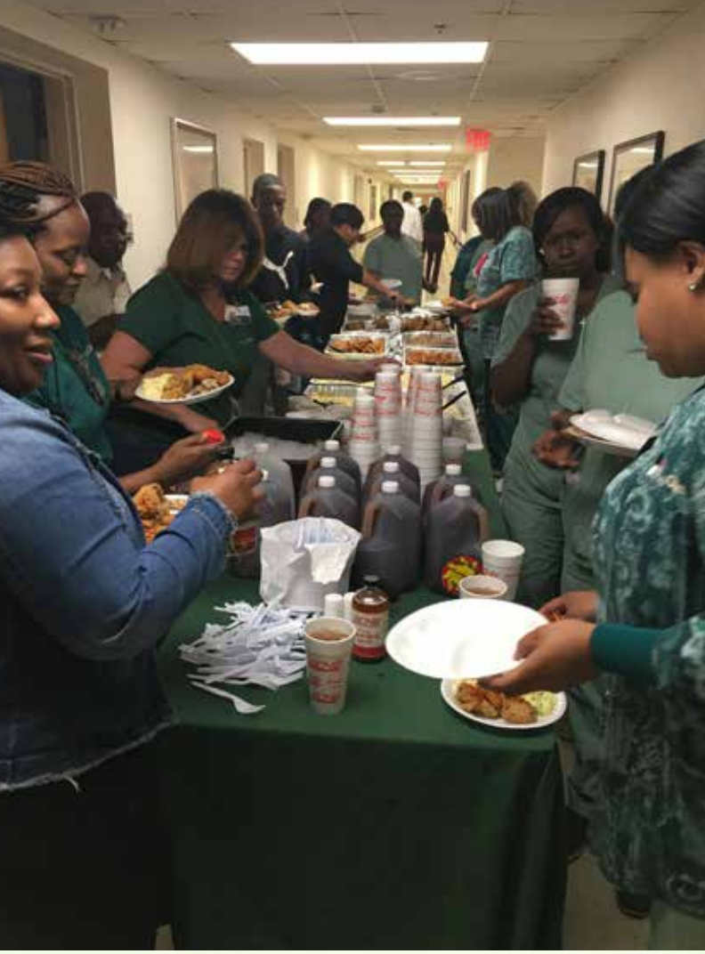
The Oaks at Whitaker Glen - Mayview