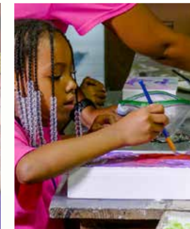
TOTAL CAMPERS IN 2019: 145+